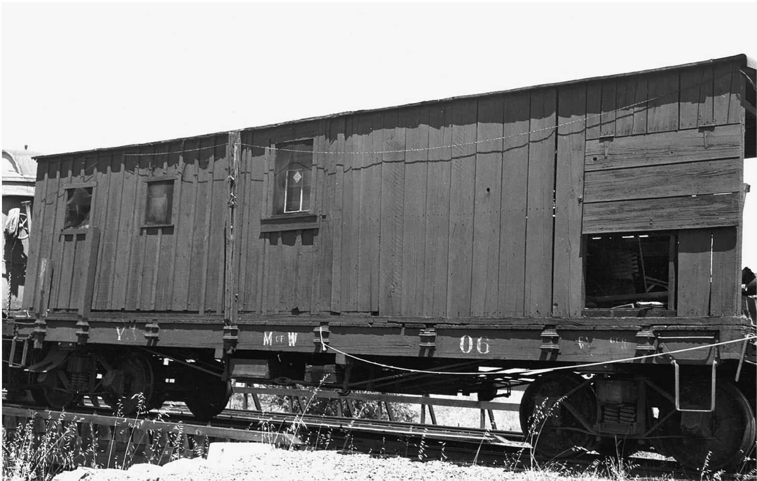
M of W 06 reveals its obvious ancestry as a flat car in this photo of the car in the Merced yards.