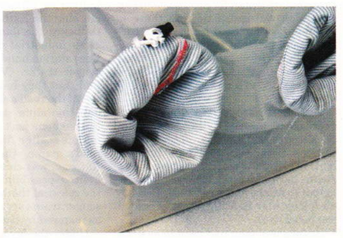
clips to hold the lid closed. The sleeves (above right) are from an old long sleeve shirt. They are hemmed and fit over plywood rings and secured with elastic cord to lock them in place.

Back in the 1980's I bought a Paasche AEC sandblaster and, while it worked well when it worked, I had problems getting it to continually operate satisfactorily. I subsequently gave up on sandblasting after that.