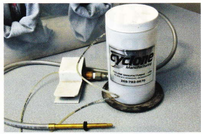
(above right) are the shop vacuum connection, a pencil sandblaster, a container of abrasive and a foot pedal air valve.

sandblasting booth online. When I was finally ready to build my own sandblasting booth those photos had been removed. My booth follows many of the general ideas posted by this chat list member, and I thank him for his ideas and inspiration.